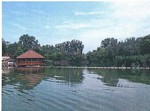
...very close to drinking water quality

I confirm the authenticity of the data introduced above: